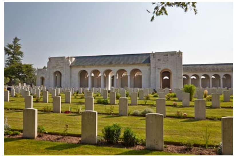
Le Touret War Memorial, Pas de Calais, France