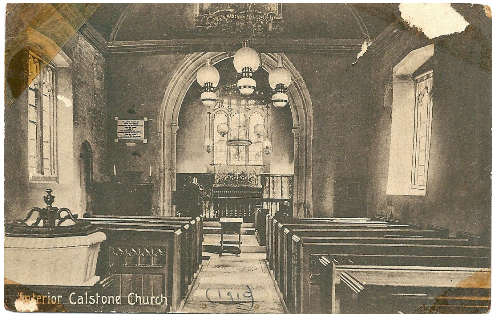
Interior Calstone Church