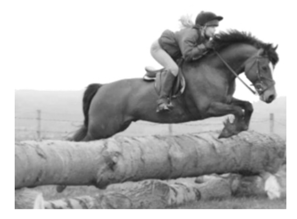
Another jump safely negotiated by Georgia Glass