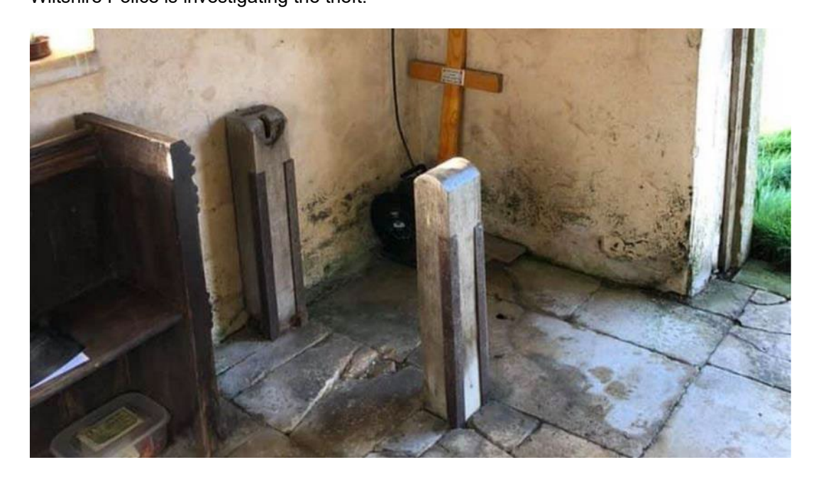
BBC News, 3 March 2020

"It's such a shame as if they had taken tiles off the roof, we could have replaced those, but this is the bell for Bremilham Church." Wiltshire Police is investigating the theft.