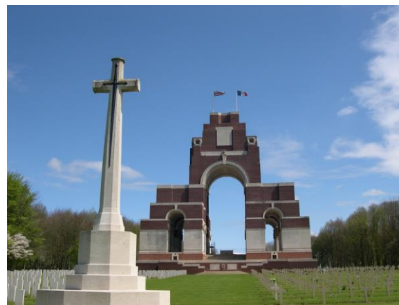
Left = Donhead St. Andrew War Memorial