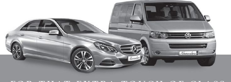
FOR THAT EXTRA TOUCH OF CLASS

M: 07810 294725 OR 07900 622124 E: alex@bhalexander.co.uk www.bhalexander.co.uk