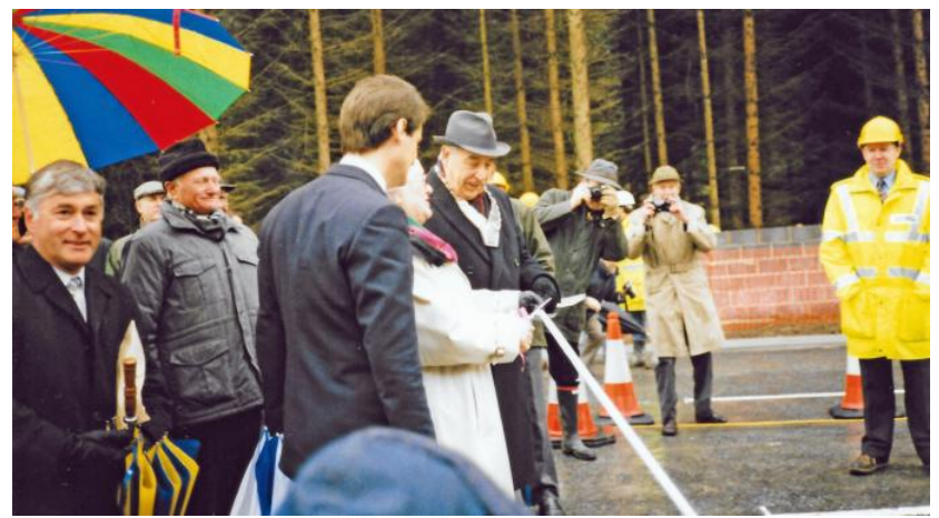
The formal opening was on Friday, 6<sup>th</sup> March 1996.