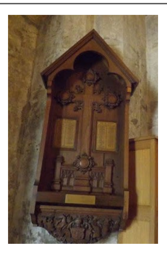
This memorial may be found in the Abbey Church at Malmesbury