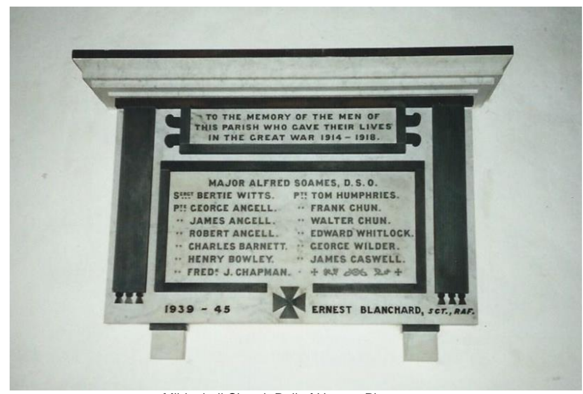
Mildenhall Church Roll of Honour Plaque

← Headstone at Ogbourne St Andrew (Churchyard Extension).