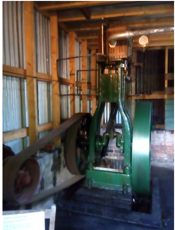
Winding machinery for the pit shaft cages.