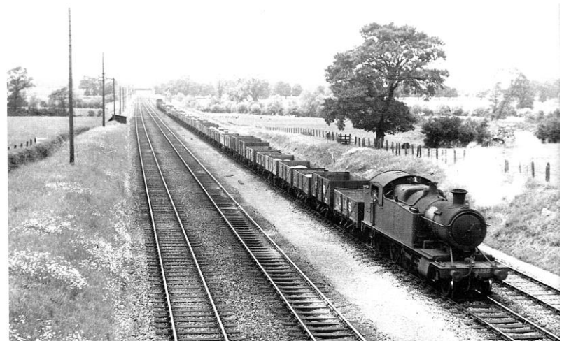
4288 heads east between Challow and Steventon