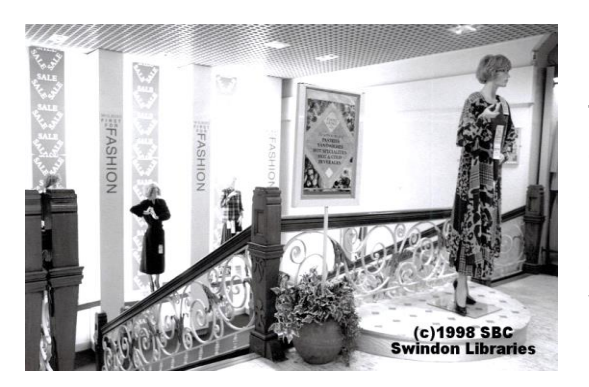
Think how many of our own ancestors must have visited over those years.

The plate glass frontage, the imposing clock tower (demolished in the 1960s for safety reasons), the grand ballroom... and THAT staircase. Wonder where that is now?