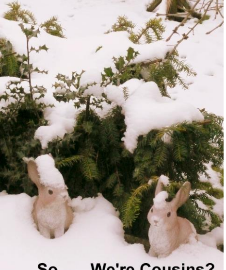
So .... We're Cousins?