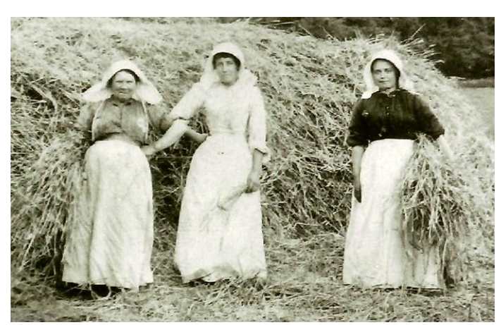
Bringing in the Sheaves

Thursday 28 September 2023 at the Central Community Centre, Emlyn Square 'Running out of Steam'