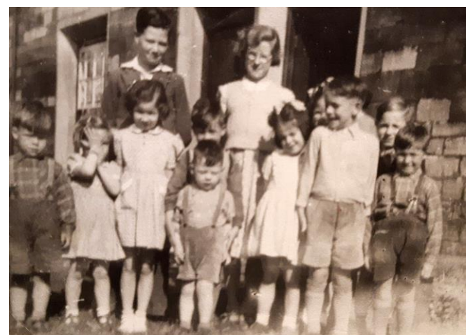
Photos: taken outside 32 Reading Street, probably to celebrate birthdays.

Do you recognise anyone in these pictures? contact <a href="mailto:swindon@wiltshirefhs.co.uk">swindon@wiltshirefhs.co.uk</a>