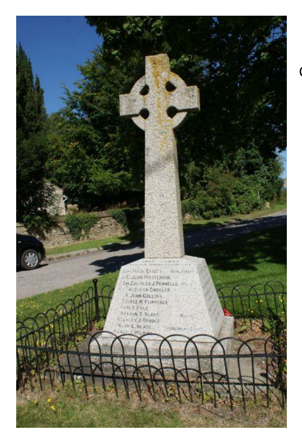
Collingbourne Ducis War Memorial and name panel at top for WWII