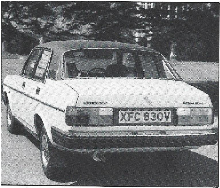
Stylish treatment of the Morris Italback end

Much longer service life results from a change to Iron-Zinc coated steel for the Ital fuel tank. In conjunction with the existing aluminised exhaust system, this newtank completes a very comprehensive 'underbody' protection programme.