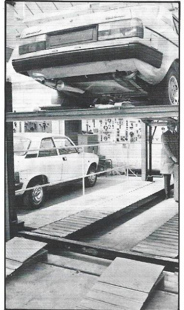
The 6,000 mile oil change has been deleted on Morris Ital

This programme is a systematic approach to improving all servicing aspects on B L cars and vans. Its main objectives are to cut the cost of ownership, simplify repair and service procedures and improve the presentation of vehicle information to both the motorist and dealer.