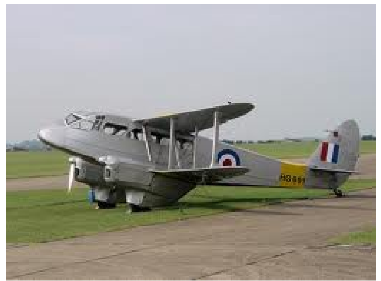
D H Dragon Rapide

who'd used it last had to go round behind the hangars and empty it on the tomatoes that were growing there - it produced some beautiful specimens! I discovered that I wasn't subject to air sickness, so I never had to empty the bucket at all.