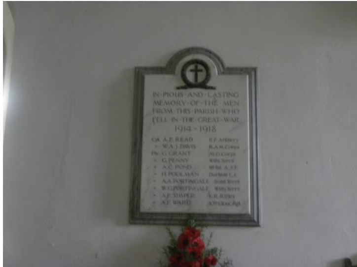
← St. Mary Church Memorial, Codford St. Mary