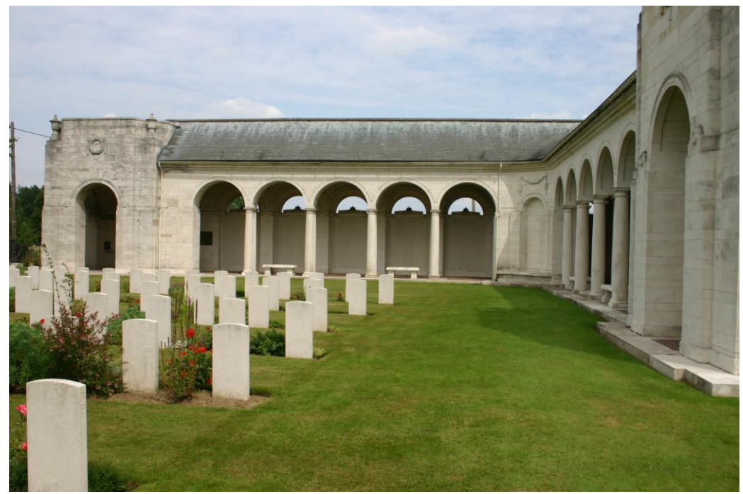
Le Touret Memorial