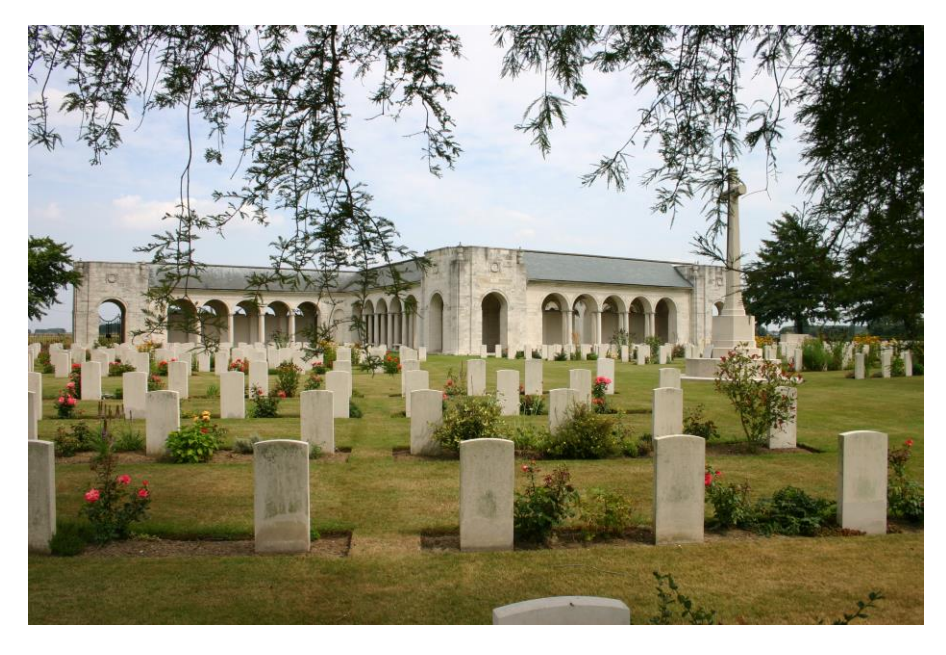
The Le Touret Cemetery & Memorial

In October 1914, II Corps of the British Expeditionary Force moved north from Picardy and took up positions in French Flanders where they were immediately engaged in the series of attacks and counter attacks that would become known as the 'race to the sea'. Over the course of the next year most of the British activity in this sector focused on attempting to dislodge the German forces from their advantageous position on the Aubers Ridge and capture the city of Lille, a major industrial and transport centre which the Germans had occupied early in the war. The ridge is a slight incline in an otherwise extremely flat landscape from which the Germans were able to observe and bombard the British lines. Following the British capture of the village of Neuve Chapelle in March 1915, the Germans greatly strengthened their defences along the ridge, reinforcing their positions with thick barbed wire entanglements, concrete blockhouses and machine gun emplacements. These extra defences frustrated British attempts to break through enemy lines and led to very heavy casualties at the battles of Aubers Ridge and Festubert in May 1915. (Information from CWGC)